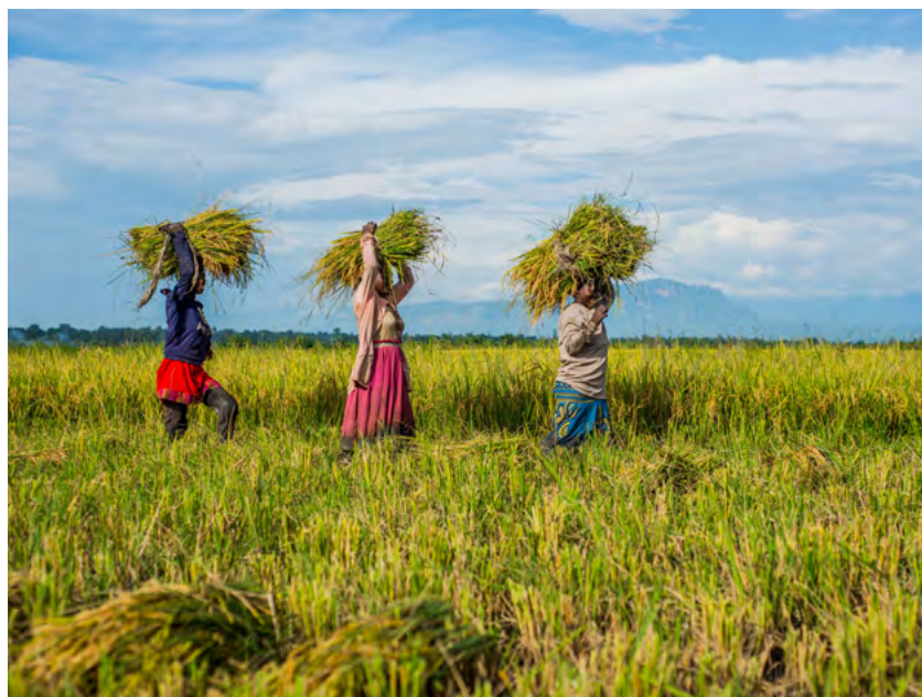
Women rice farmers associated with the Sustainable Rice Platform in the Butaleja District, Uganda.